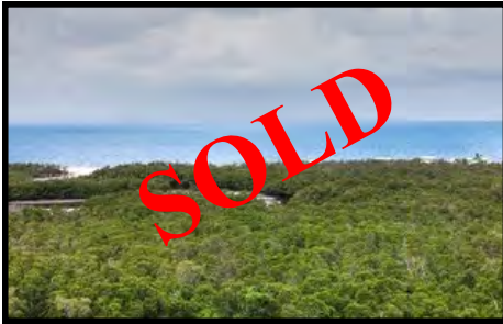
St. Maarten @ Pelican Bay —2+Den, 2 baths, turnkey furnished, BREATHTAKING GULF/SUNSET VIEWS from this 12th floor condo—Location! Click Here $470,000