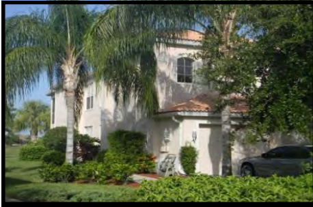
Heritage Greens —3 bedrooms plus Den, 2 baths, 1 car garage, 2,050 sq ft. under air, western lake & golf course views, new carpet, wood floor & paint. Click Here $229,000