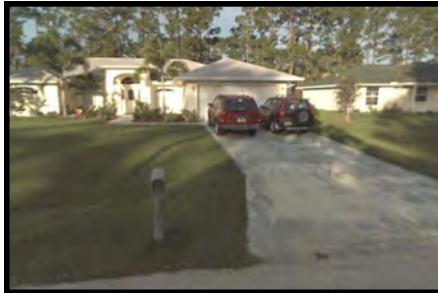
North Port —3 bedrooms, 2 baths, 2 car garage, 1,923 sqft under air, granite counters, maple wood cabinets, lush landscaping, on canal. Click Here $75,000