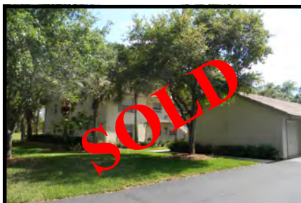
Sherwood —2 bedrooms plus Den, 2 baths, 1 car garage, 1st floor end unit, 1,225 sqft under air, beautiful lake views, many recent updates! Click Here $120,000