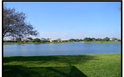
Heritage Greens —2+Den, 2 baths, 2 car garage, over 1,700 sq ft, endless & private lake/golf views, upgraded cabinets & countertops, Priced right! Click Here $249,000