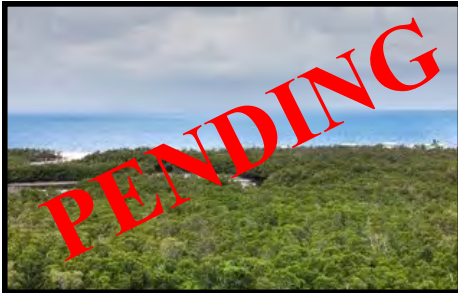
St. Maarten @ Pelican Bay —2+Den, 2 baths, turnkey furnished, BREATHTAKING GULF/SUNSET VIEWS from this 12th floor condo—Location! Click Here $539,000