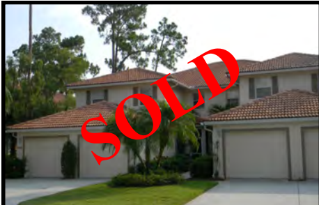
Sherwood —3 bedrooms, 2 baths, 1 car garage, 1,630sqft, beautiful long lake view, new tile & carpet, freshly painted, original owner, immaculate! Click Here $150,000