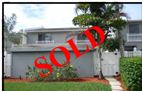
Spanish Wells —2 bedrooms (both Master Suites), 2.5 baths, 1,400 sqft. Western golf course views, screened lanai, and courtyard patio entrance. Click Here $75,000