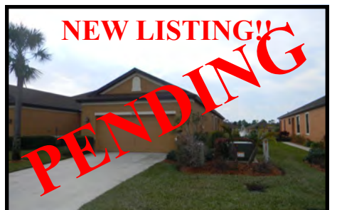
Terra Vista —2+Den, 2 baths, 2 car garage, beautiful southern lake/fountain views, over 1,800 sq ft., attached villa lives like single-family home! (Pocket Listing) $129,900