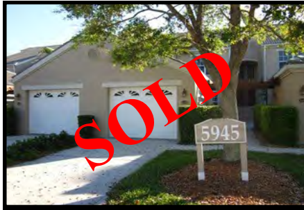
The Strand —2 bedrooms plus Den, 2 baths, 1 car garage, 1,490 sqft., 1st floor, golf course views, Southern exposure, Bank Foreclosure! Click Here $156,000