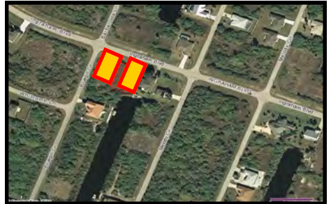
Port Charlotte —2 vacant neighboring lots in Port Charlotte—1 corner lot, 1 with Gulf Access! Each lot is nearly 1/4 acre in size! Corner Lot Gulf Access Lot $125,000/both