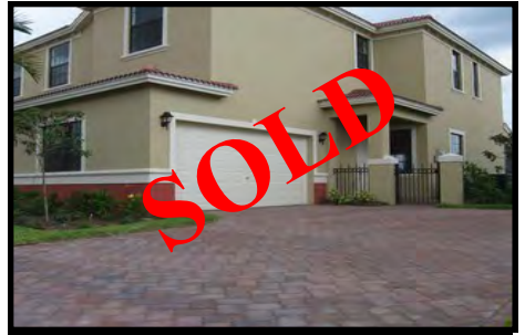
Summit Place —3 bedrooms, 2.5 baths, 2 car garage, beautiful lake view, nearly 2,300 sq. ft. under air, large Master Suite, and lots of upgrades. Click Here $151,000