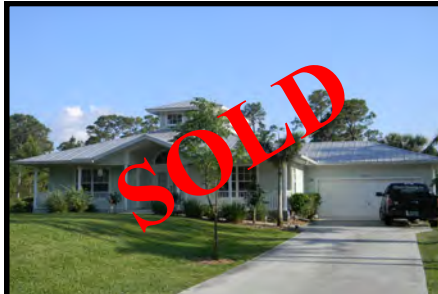
Golden Gate —3 bedrooms, 2 baths, 2 car garage, Colonial style home with front/back porches, over 1 acre of land, fenced-in backyard! Click Here $110,000