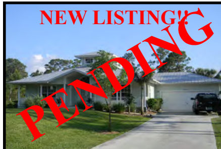
Golden Gate —3 bedrooms, 2 baths, 2 car garage, Colonial style home with front/back porches, over 1 acre of land, fenced-in backyard! Click Here $110,000