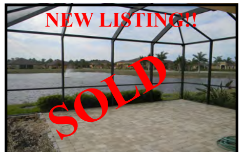
Terra Vista —2+Den, 2 baths, 2 car garage, over 1,700 sq ft., granite counters, 42" cabinets, crown molding, diagonal tile, lake view from extended lanai. Click Here $129,800