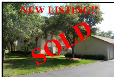
Sherwood —2 bedrooms plus Den, 2 baths, 1 car garage, 1st floor end unit, 1,225 sqft under air, beautiful lake views, many recent updates! Click Here $120,000