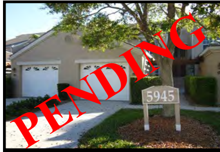
The Strand —2 bedrooms plus Den, 2 baths, 1 car garage, 1,490 sqft., 1st floor, golf course views, Southern exposure, Bank Foreclosure! Click Here $159,900