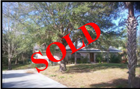
Golden Gate Estates —3 bedrooms (each w/ a walk-in closet), 2 baths, 2.73 acres of land, split floor plan, tiled kitchen counters, and wood floors! Click Here $90,000