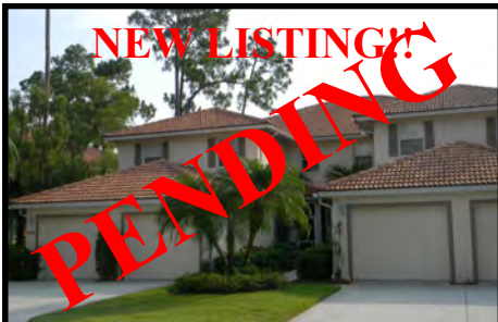
Sherwood —3 bedrooms, 2 baths, 1 car garage, 1,630sqft, beautiful long lake view, new tile & carpet, freshly painted, original owner, immaculate! Click Here $164,900