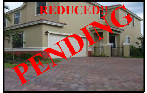
Summit Place —3 bedrooms, 2.5 baths, 2 car garage, beautiful lake view, nearly 2,300 sq. ft. under air, large Master Suite, and lots of upgrades. Click Here $159,000