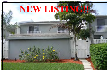
Spanish Wells —2 bedrooms (both Master Suites), 2.5 baths, 1,400 sqft. Western golf course views, screened lanai, and courtyard patio entrance. Click Here $110,000