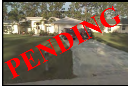
North Port —3 bedrooms, 2 baths, 2 car garage, 1,923 sqft under air, granite counters, maple wood cabinets, lush landscaping, on canal. Click Here $75,000